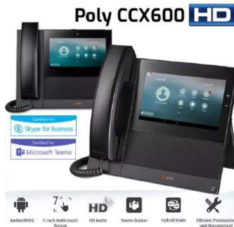
Telephony uses any Teams enabled device. Hardware is available as a service.